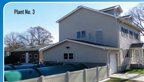
Plant No. 3

To date, an MCL standard for 1,4-dioxane has not yet been established, yet this hasn't prevented SFWD from preparing for our future. Our Advanced Oxidation Process (AOP) pilot program at Plant No. 3 yielded success to treat this emerging contaminant, and our plans to build out the treatment facility are with the Nassau County Department of Health for approval. The District anticipates putting out construction bids as early as Summer 2020.