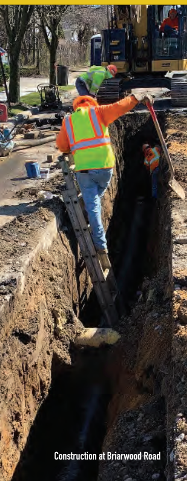
Construction at Briarwood Road

Maintenance to the District's distribution system is a necessity, and keeping up with 124 miles of water main certainly doesn't happen overnight. To put it into perspective, 124 miles is almost the length of Long Island... from Montauk to westernmost Brooklyn. It's also the distance from Los Angeles to San Diego!