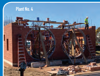
Plant No. 4

SFWD is constantly evolving and advancing the way water is delivered to consumers. Each season we provide updates on our developments at our facilities across our District. Here's the latest on some current projects: